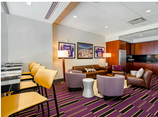
TIGER DEN SUITES

To view a seating chart of Tiger Stadium, visit LSUsports.net/seating .