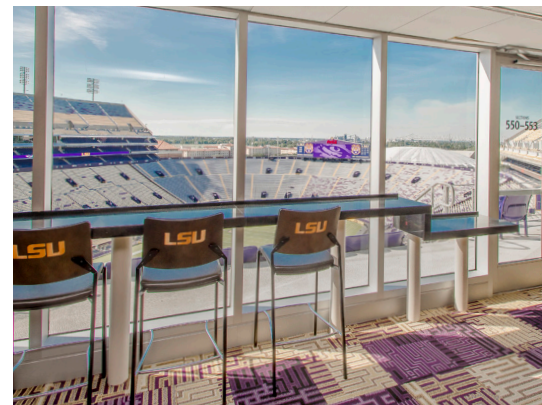
STADIUM CLUB SOUTH