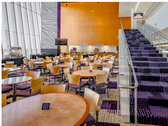
STADIUM CLUB WEST