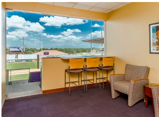
ALEX BOX SUITES

To view a seating chart of Alex Box Stadium, visit LSUsports.net/seating .