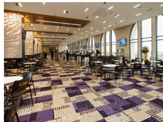
STADIUM CLUB SOUTH