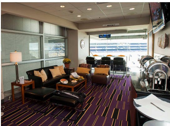
TIGER DEN SUITES

To view a seating chart of Tiger Stadium, visit LSUsports.net/seating .