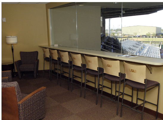
ALEX BOX SUITES

To view a seating chart of Alex Box Stadium, visit LSUsports.net/seating .